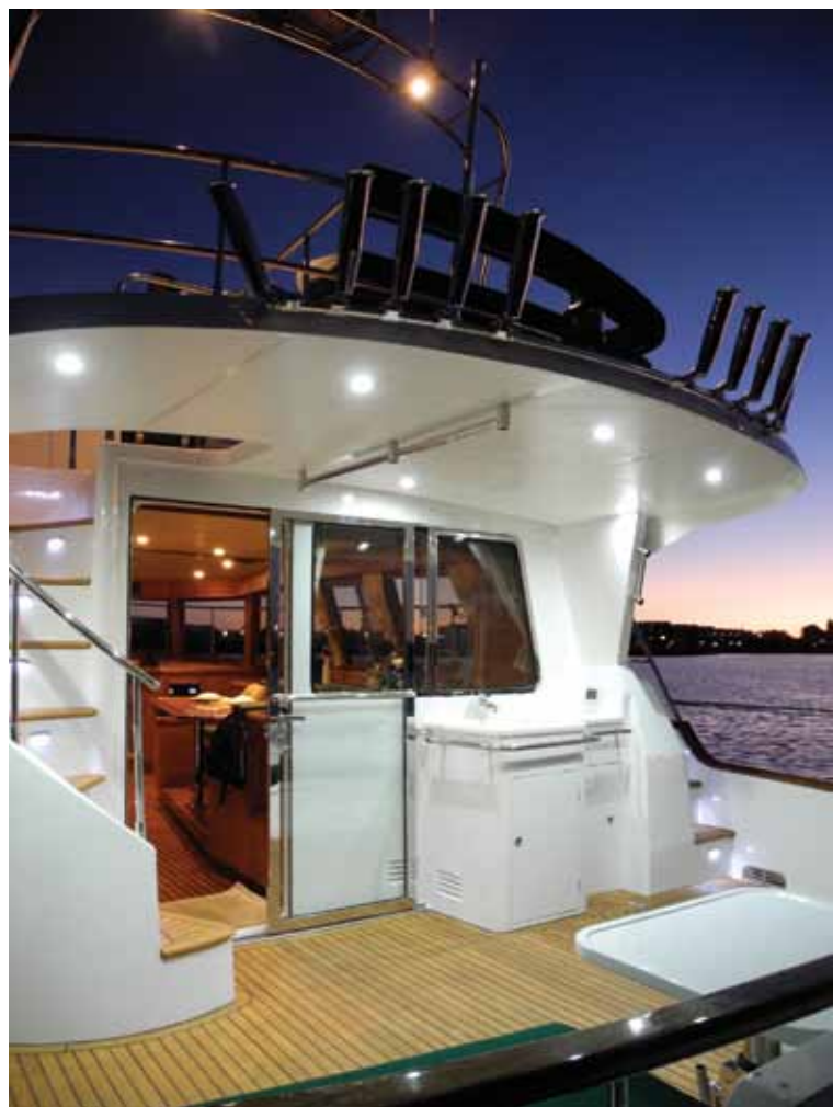
The aft deck, shown here with optional teak decking, is wide and spacious, yet equipped with numerous handholds for safety.

The helm spans the width of the saloon forward, with a raised instrument panel sized for two large MFD displays. A 24-inch stainless steel wheel with teak rim commands a SeaStar hydraulic system, which answers steering commands quickly. With the exception of a small angle of obstruction created by the pantry locker to port and aft, visibility from the helm is exceptional. An overhead hatch with Oceanair pullout screen or shade gives the helmsman