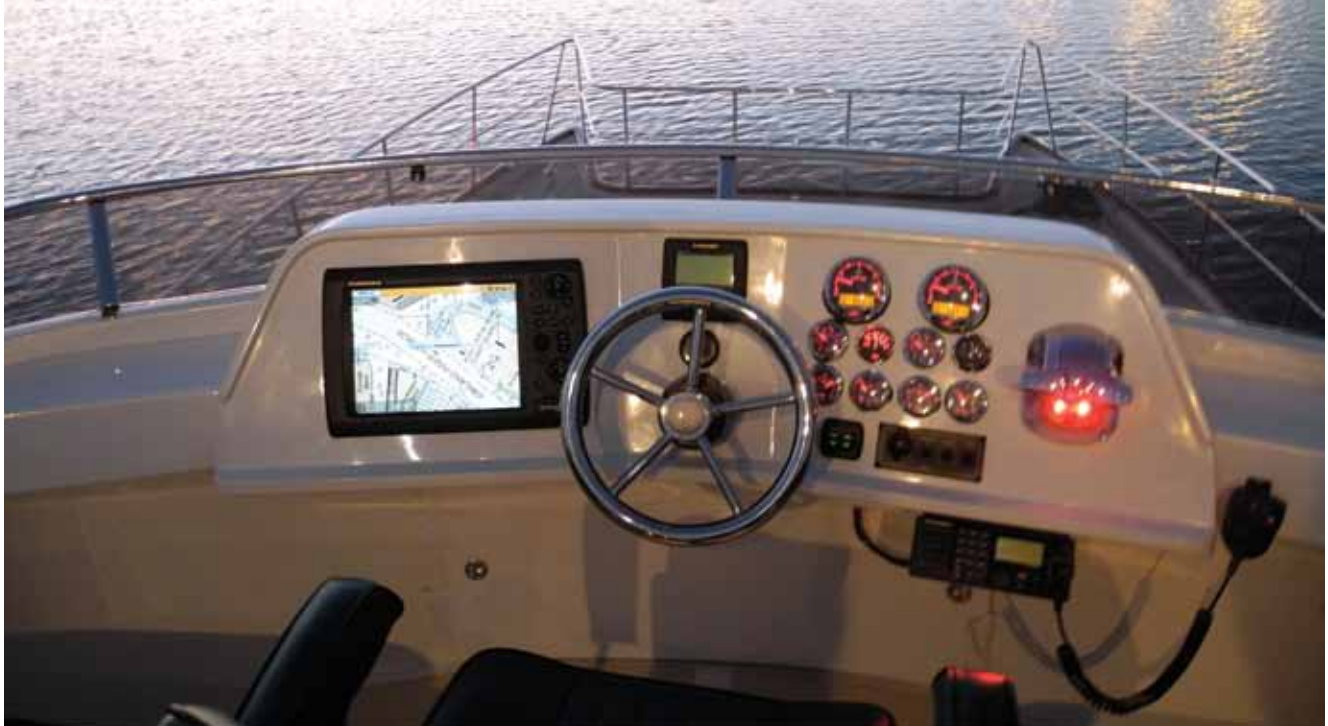
The centerline bridge helm has excellent views of all four corners of the boat, plus a complete set of engine performance gauges mirroring those in the pilothouse, as well as a remote multifunction display.

which slides smoothly and latches open or closed positively, is fabricated by Jet Tern. Tempered glass is 1/2-inch thick all around, except for the sliding door, which is 3/8-inch thick. Jet Tern craftsmen also created a clever stainless steel hand-crank mechanism to raise and lower the cockpit table between the bench seats.